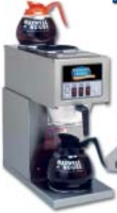
Decanter Brewers with Branded Bowls