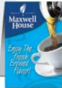
Branded Table Tent