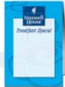
Custom Imprinted Table Tent