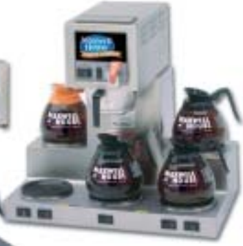
Five Station Automatic Brewer with Branded Bowls