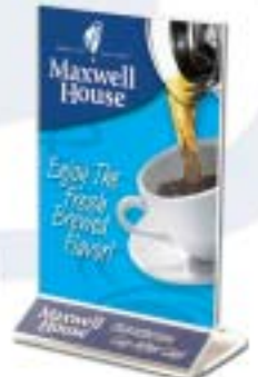
Acrylic Table Tent Holder

Ask about our other merchandising materials and turnkey promotions.