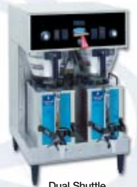
Dual Shuttle Brewer