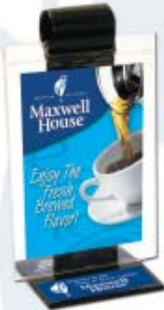
Flip Tent Holder