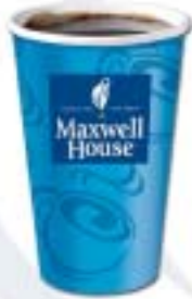
Branded Paper Cup