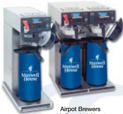
Airpot Brewers with Branded Airpots