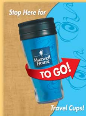
Poster: To drive customer awareness and increases participation.