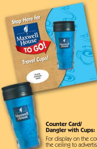
Counter Card/ Dangler with Cups:

For display on the counter or hang from the ceiling to advertise program to customers.